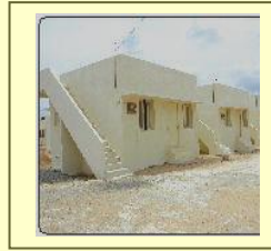
Tsunami Rehabilitation Project 140 Häuser under construction, thereof completed to date 34